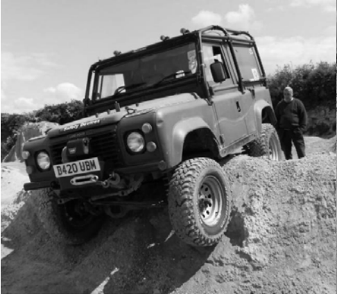
Stan and his 90 getting stuck on a hump!

A lovely day out in the sun, testing what silly things out motors and their drivers can do!