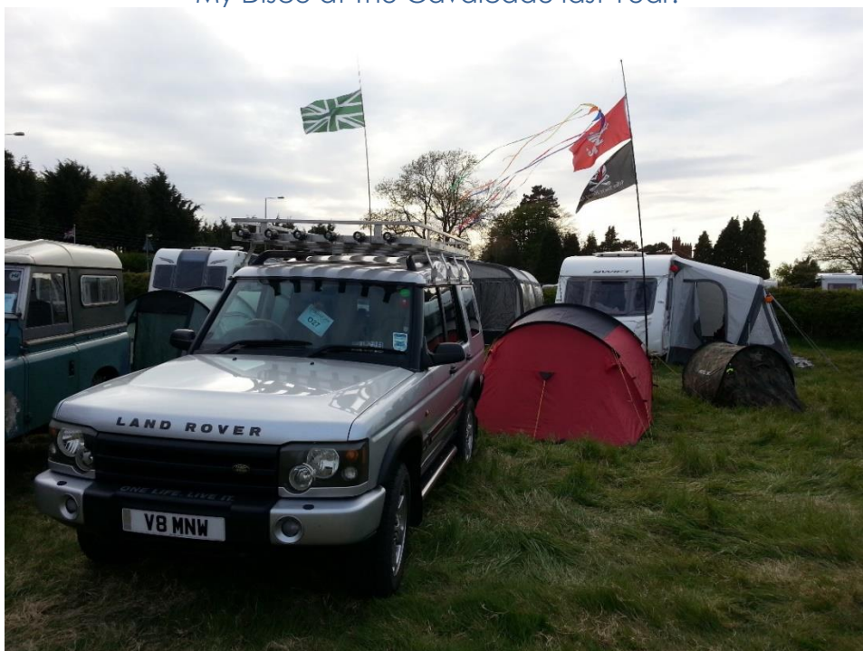
My Disco at The Cavalcade last Year!